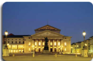
Bavarian State Opera